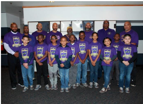
Brigadier General Charles Young Mentoring Gwinnett County and area Middle Schools

Visit https://www.blques.com/bl-omega-stem for a great video on STEM!