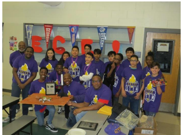
Students Competing in S.T.E.M.

Annually the See It Through Foundation of Gwinnett and Beta Lambda Lambda Chapter of Omega Psi Phi host an Achievement Week Celebration where gifted students are recognized for their accomplishments both in the classroom and in the community. Also, Gwinnett County citizens are recognized through our Citizen of the Year Award for dedicated service, philanthropy and making a positive impact in the communities they live, work and play in.